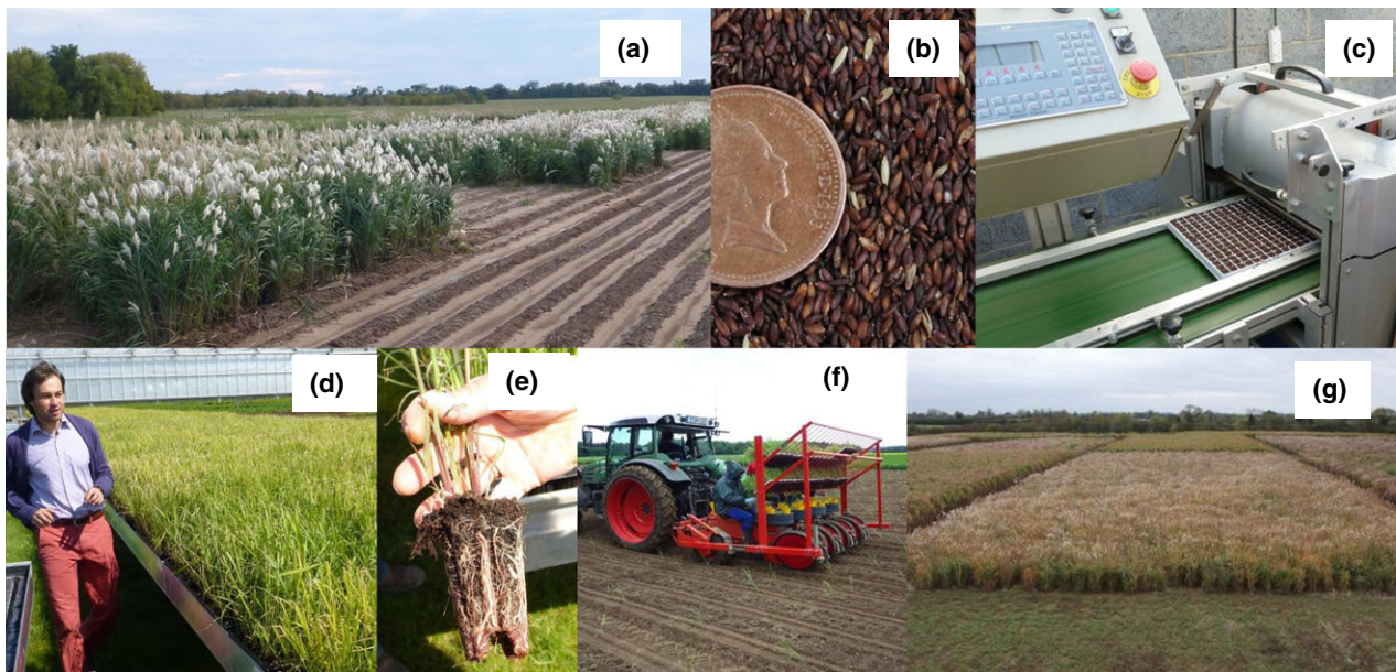
Fig. 1 Steps taken to develop seed-based Miscanthus hybrids: (a) Field seed production trials in CERES, USA. (b) Threshed Miscanthus sinensis seed with a British pound coin for scale. (c) High throughput plug sowing. (d) Dr. Michal Mos, checking plugs which are hardening for field planting in Lincoln. (e) A field-ready plug. (f) Mechanical planting of plugs with a Unitrium plug planter in Stuttgart, Germany. (g) Large-scale replicated 0.25 ha plot trials in Lincoln, UK.

The chances of seedling establishment in the temperate zones can be improved by covering the seed bed after sowing with photodegradable transparent polymer mulch films, as is used for maize (Keane et al. , 2003). These film coverings create conditions conducive to