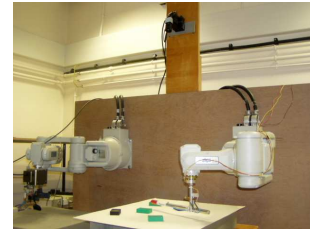
Figure 1: The laboratory robot system used in experiments

Even before any cross-modal spatial integration can begin it is necessary to first discover the structure of the local spaces within each modality. Various stages in behavior can be discerned and during these stages the local egocentric limb space becomes assimilated into the infant's awareness and forms a substrate for future cross-modal skilled behaviors. The essential correlation between proprioceptive space and motor space