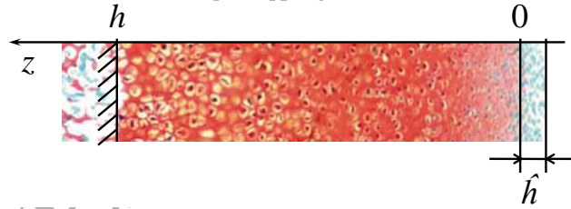
Figure 1. An elastic coated layer as a model for articular cartilage (the histological image of articular cartilage is taken from the paper [26]). The regions -\hat{h} \leq z \leq 0 and z \geq h represent the superficial zone and the subchondral bone, respectively.

We consider a very thin transversely isotropic elastic coating layer (of uniform thickness \hat{h} ) ideally attached to an elastic layer (of thickness h ) made of another transversely isotropic material (see Fig. 1). Let the five independent elastic constants of the elastic layer and its coating be denoted by A_{11} , A_{12} , A_{13} , A_{33} , A_{44} and \hat{A}_{11} , \hat{A}_{12} , \hat{A}_{13} , \hat{A}_{33} , \hat{A}_{44} , respectively.