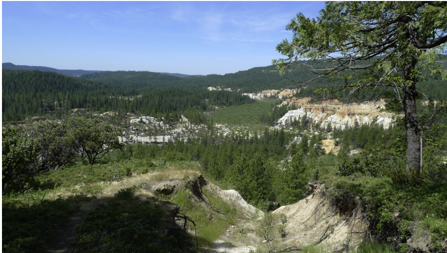
Fig. 1. View of Malakoff Diggings from the overlook of chute hill campground at Malakoff Diggings State Historic Park, Nevada County California, taken by the author.

contradiction: irresponsible perpetrators of ecocide for some, and, for others, noble pioneers taming wild nature with their technological ingenuity and hard work.