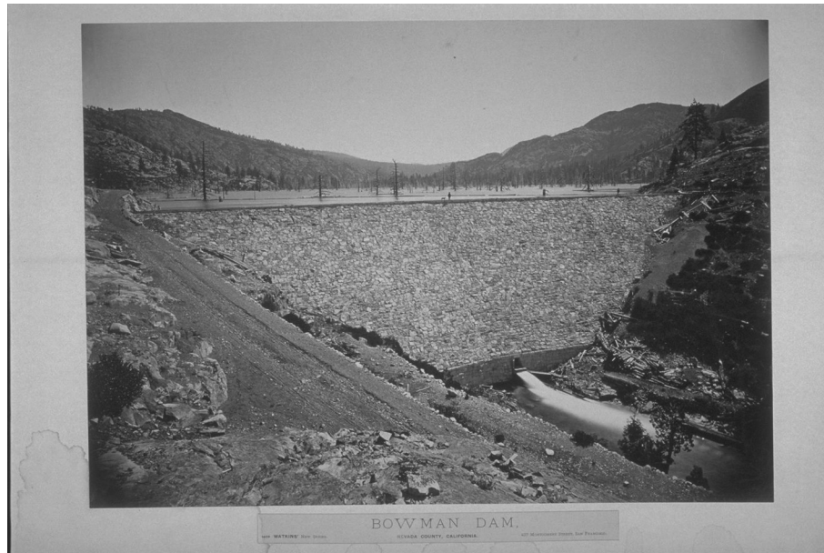
Fig. 4. The Bowman Dam and Keeper's Residence, Hearst Collection of Mining Views by Carleton E. Watkins, The Bancroft Library, University of California, Berkeley, BANC PIC 1905.17172--ffALB.

trip over the ditch to Graniteville for supplies. He records that much of that same summer was spent fighting forest fires, trying to keep flames away from flumes. We know that in the following February he was having money problems and must have received some sort of sanction from his boss because one weekly letter from that month starts with the words: 'I am sorry to have annoyed you this way but I could not help it for if I pay old bills I cannot pay my present expenses'. His last letter in the archive, on June 19th 1899, begins as did every other with his favoured refrain 'Everything is alright up here at Bowman Dam'. It finishes with a report on some repair work to the flumes and, perhaps more worryingly, the brief notification of a leakage of two hundred inches in the main dam wall.