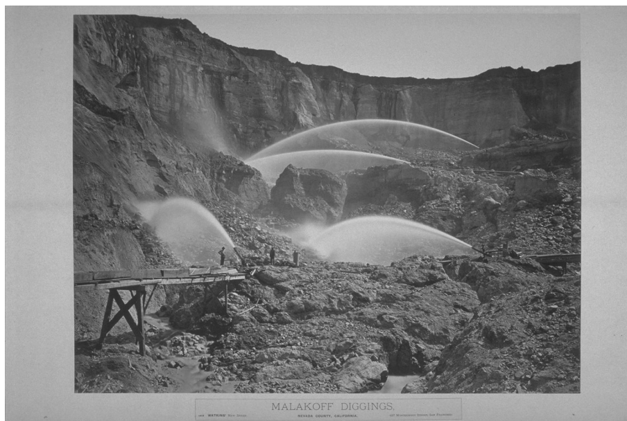
Fig. 3. Malakoff Diggins

which was painful to behold. Bloomfield today is only a mere skeleton of what it was during the prosperous era of hydraulic mining. The lethargy and inactivity is not due to the indifference or disregard of the citizens for the welfare of that once lively burg, but to the suppression of hydraulic mining. Bloomfield depends on this particular industry for its support and its commercial and financial prosperity.... During the evening we visited some of the prominent business places and pleasure resorts, and everywhere we were confronted with groups of men, a majority of them being pioneers, who had passed from young buoyant manhood to the age of maturity in the mountains, and in a deeply pathetic