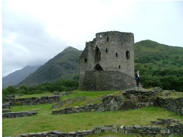
Fig. 4: Dolbadarn Castle, Llanberis

Finally, we also want to target school children, especially in the Welsh language, to allow them to play with their heritage and at the same time, learn valuable skills in various subjects. With Welsh (pre-) history being an important element to the Welsh National Curriculum, being able to directly engage with the physical remains of their past will naturally contribute to history teaching, and in an exciting ‘modern’ way at that. For students to be able to tell stories, whether factual or fictional, about their heritage will not be just enjoyable, but will also increase linguistic and creative skills. In addition, the technical element of taking archaeological photographs with ranging poles or other scales included, and the metrical elements of photogrammetric technology, will be useful for training in more ‘scientific’ subjects like mathematics, physics and geography; all while playing with fancy technology and creating ‘cool’ 3D models (which look as if they come out of and could perhaps even directly be imported into some current computer games).