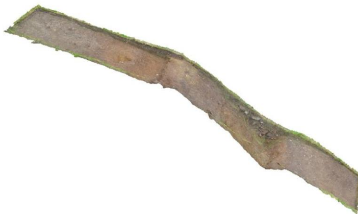
Fig. 3: 3D model of a trench at Moel Fodig hillfort, created from photos taken by local volunteers