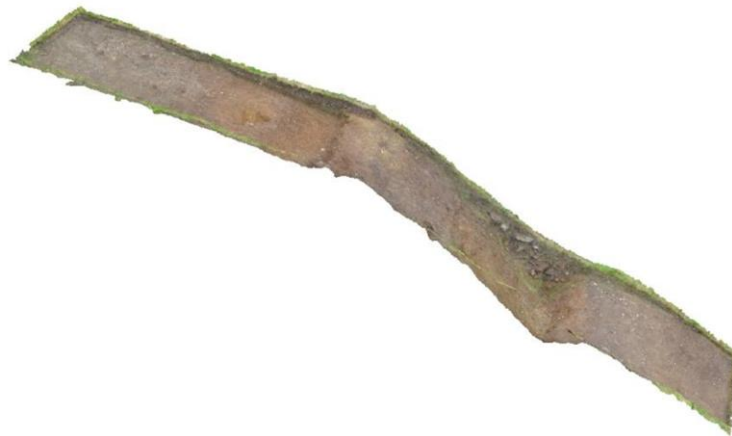
Fig. 3: 3D model of a trench at Moel Fodig hillfort, created from photos taken by local volunteers