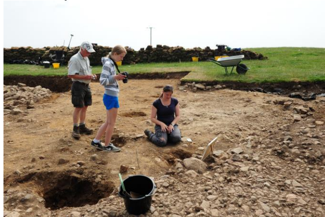
Fig. 2: A member of staff, a local work experience student and a German excavation tourist, taking pictures of features for 3D modelling on a Bangor University excavation in Meillionydd in summer 2013

Both these projects, however, were still focused on making heritage data considered to be important by professional archaeologists available to the public, rather than transferring (at least some of the) decisions as to what is significant heritage to local communities into the hands of members of these communities. The new collaborative project ‘Co-production of alternative views of “lost” heritage’ now aims at giving these communities means of preserving by record what they consider is important to them. They can then feed that information into professional archaeology and into heritage management. We also aim at giving them a role in quality control of records, and monitoring of the heritage chosen by them, and allow them to record their own stories and memories about that heritage. In this, we are partially following and expanding on earlier examples set by (for example) English Heritage in developing community involvement in and researching community engagement with and interests in heritage, particularly among young people, and especially using photography as a hook (Bradley et al. 2011).