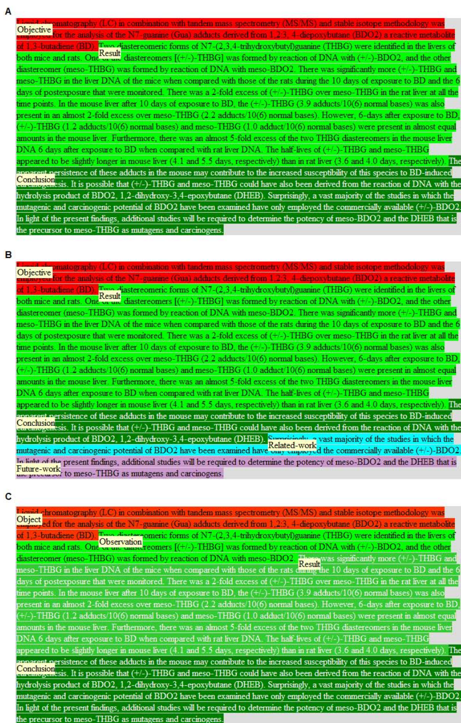
Figure 1 An example of an abstract annotated manually according to S1 (A), S2 (B) and S3 (C).