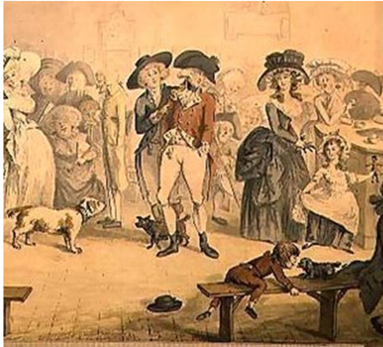
Fig 36: (Bottom) The Pump Room (John Claude Nattes, 1804)