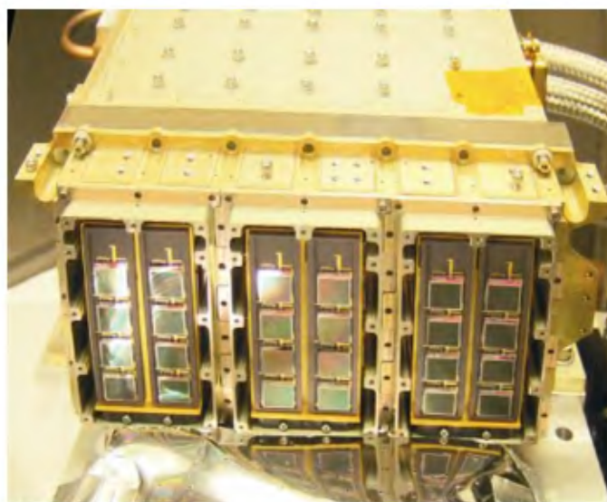
Figure 2. View of the C1XS flight instrument during integration. The collimator assembly and doors have not yet been added, so that the 24 swept-charge detectors, arranged in ladders of four, are clearly seen.

C1XS will provide data on major element geochemistry (and especially Mg/Si and/or Mg/Fe) in the main lunar terrain types (i.e. Procellarum KREEP Terrain, South Pole-Aitken Basin, and the Farside Highlands) and establish the geographical distribution of magnesian suite rocks. One of the important scientific objectives is to determine the large-scale stratigraphy of lower crust (and