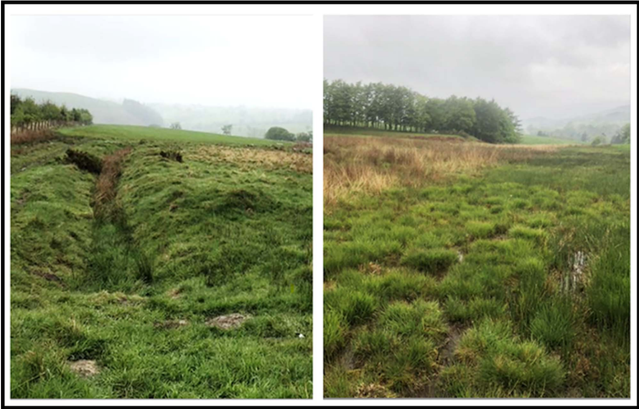
Fig. 1. Example of a watercourse habitat (left) and pasture habitat (right), both from Farm B in this study.