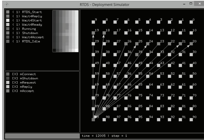
Fig. 3. Deployment simulator interface with live and post-mortem traces.